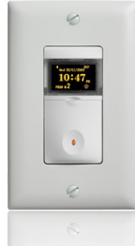
Programmable Timer Wall Switch