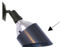
Parshield Floodlight Glare Tamer