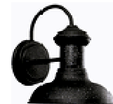
Fully Shielded Porch Light

All these steps will save money and help reduce light pollution