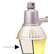
Barn Light Half Shield