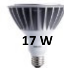
PAR 38 LED Flood