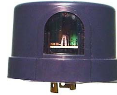
Photocell Timer For Barn Lights