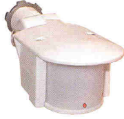
Photocell/ Motion Sensor